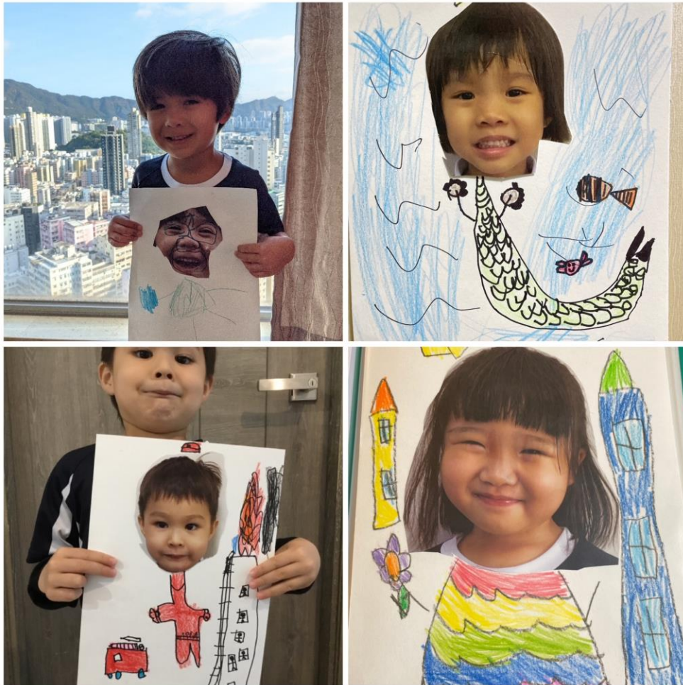
Thanks Reception class – great to have you involved with us all.