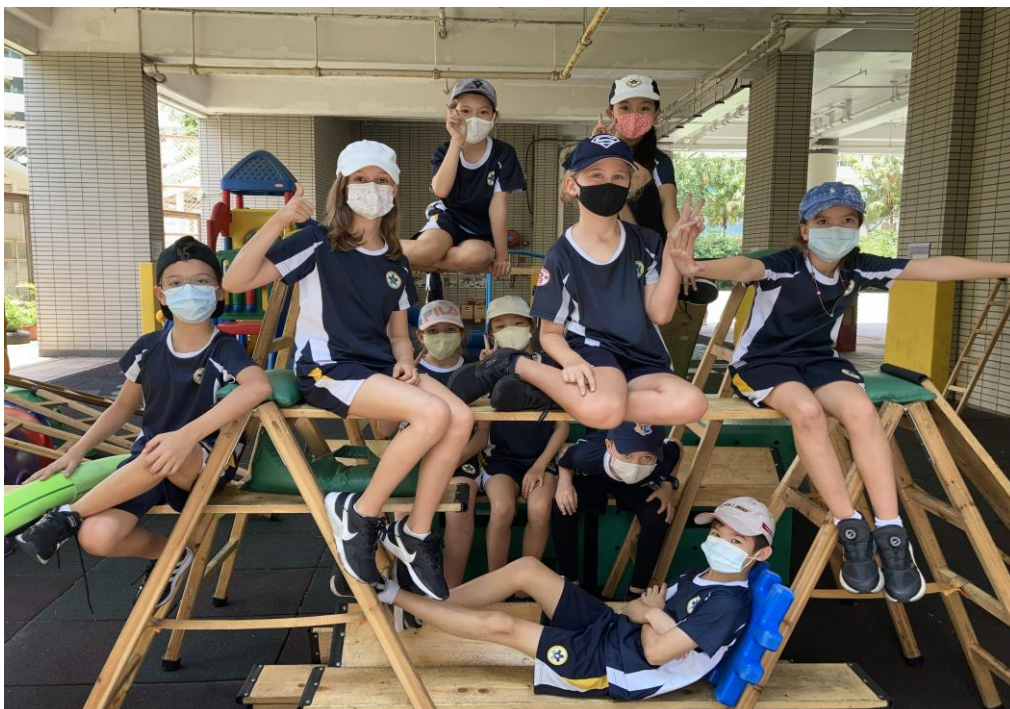
Photo of the week! – P5 architects, proudly show off their work today!

Friday 25th: JIS student half year school reports sent home today (Jan – June reports)