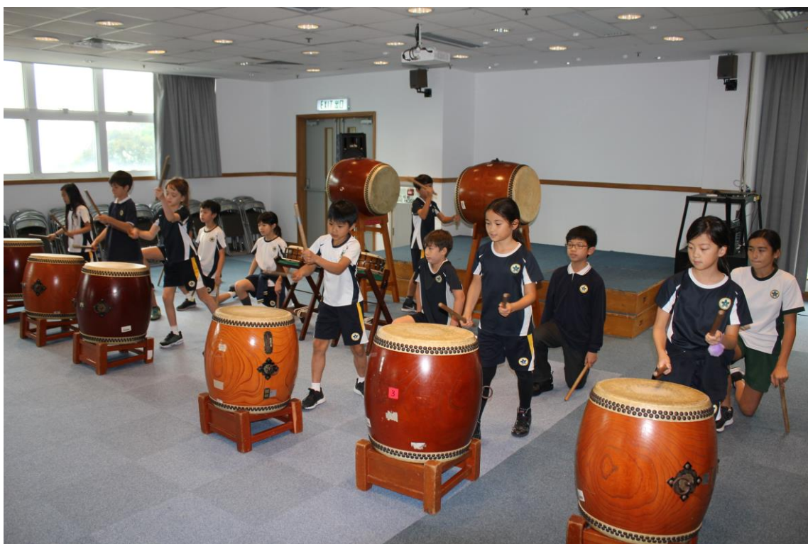
Final rehearsal in the MPR today.

Good luck to our drummers who represent our school at the I.B. Asia World Conference, opening ceremony at Asia World Expo on Sunday: