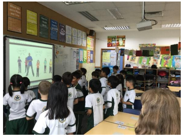
The programme supports our three JIS core values,