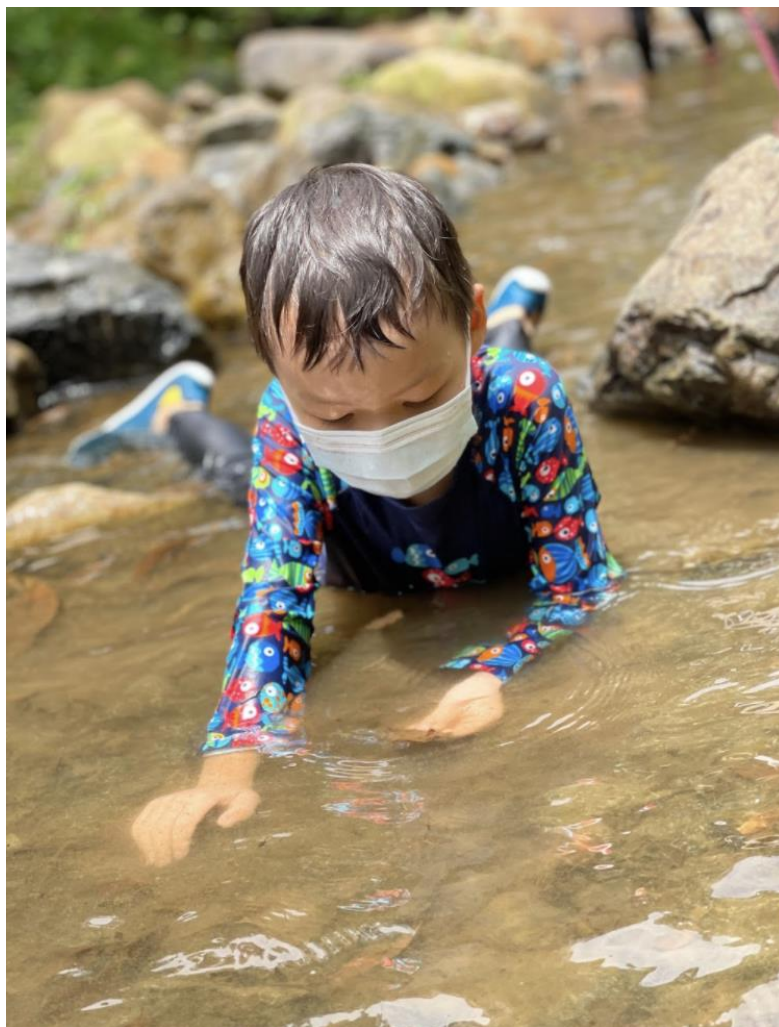
Photo of the week! – Learning in and enjoying the local environment!

Wishing everyone a really enjoyable weekend!