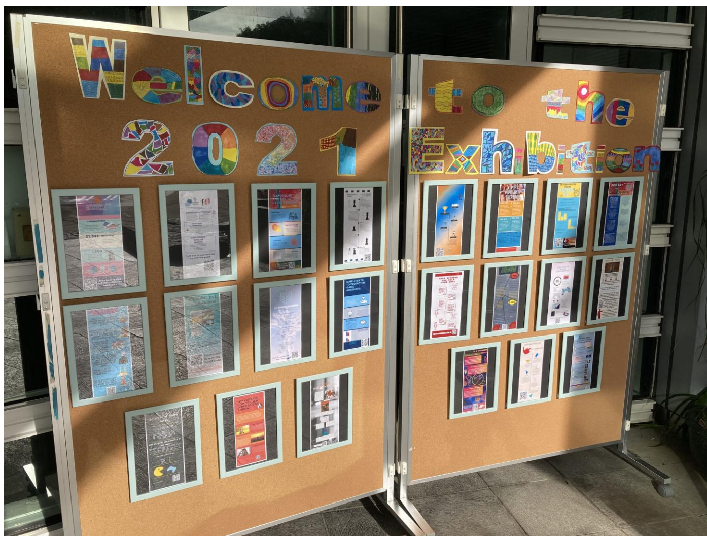
The P6 Exhibition display boards at our entrance today.

The P6 students have launched their Exhibition this week. The Exhibition has had to be online this year but the class has used a variety of new tools to share their learning. They have all done a great job!